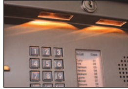
led lighting illuminates keypad and directory