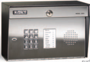
surface mount with built in directory/ message window