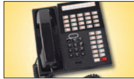
dtmf tone output allows these systems to be used with PBX, KSU and telephone systems with auto-attendants