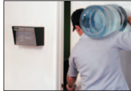
flash entry codes allow entry on a single day only, then automatically deactivate themselves